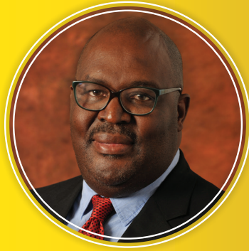
Hon. ADJ Ndou Deputy Speaker